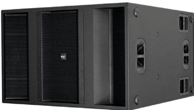
VHD4.21 Active Subwoofer