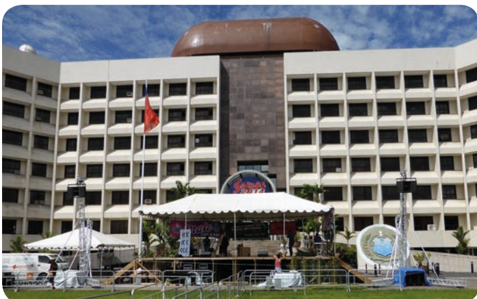
The SL412s look tiny against the backdrop of government house in Apia, Samoa