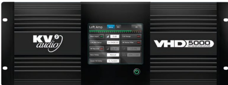
VHD5000 digitally controlled amplifier.

The release of VHD5.0 will coincide with that of the VHD4.21 Active Subwoofer System . Using new amplifier technology these subs will be the most powerful on the planet with the capability of delivering an incredible peak power output of 14Kw. Due to the massive output of the amplifier two units must be connected together to distribute the power to workable levels.