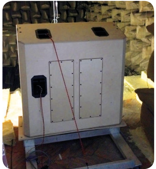
VHD5.0 Prototype being tested in KV2 Chamber

The release of VHD5.0 will be the first major step forward in large-scale sound reinforcement since the introduction of the line array nearly 30 years ago. It will have a big effect in truly establishing KV2 as a high-end audio company.