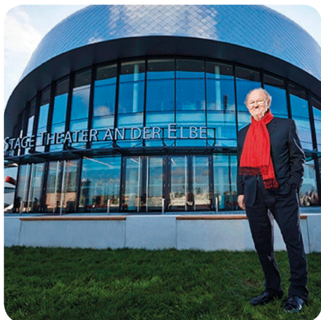
President of Stage Entertainment Joop van den Ende outside the new state of the art theatre, Stage Theatre An Der Elbe, in Hamburg Germany. Installed are SL412s, SL215s, VHD2.21s and various ESD fill speakers.

Theatrical Sound Coordinator, Stage-Entertainment GmbH