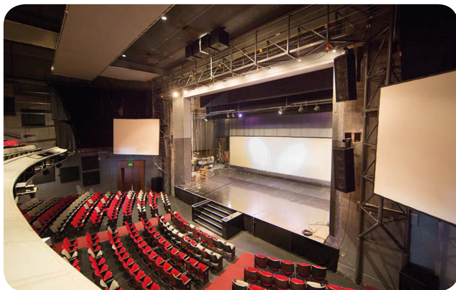
The Ricardo Montalban Theatre in Hollywood featuring a double ESR215 system with ES2.6 subwoofers, ESD36 and ESD15 fill speakers. Come and hear it during the NAMM show in January 2015.