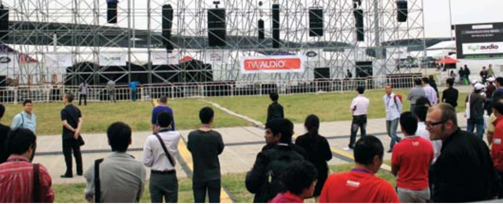
Shanghai Pro Light & Sound