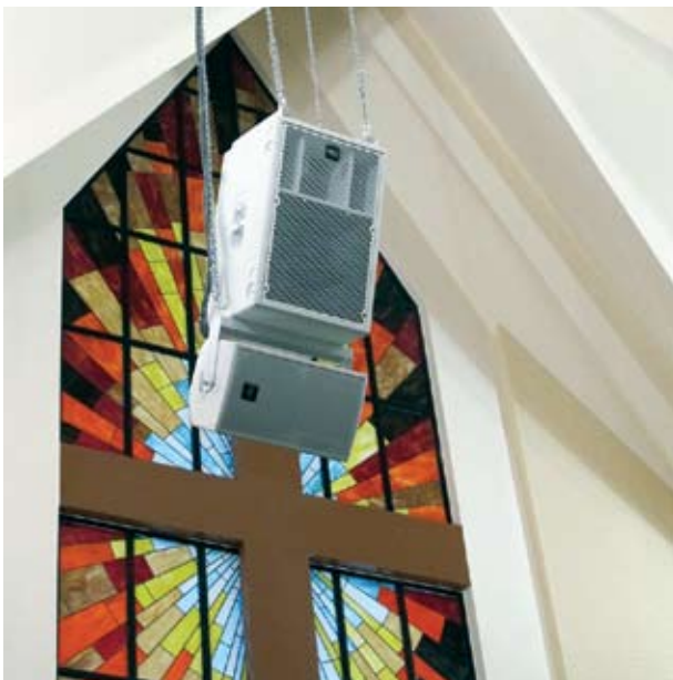
One of Sindo's ES installs in Singapore using an ESD10 as downfill