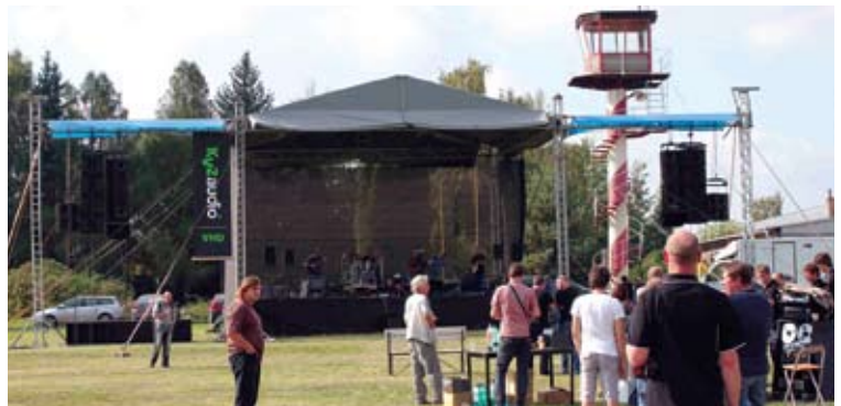
One of the large KV2 demos held in Czech at the Tabor Airfield