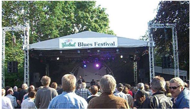
Grolsh Blues Festival

Long time KV2 supporters Sindo Exports have been working hard in the South East Asian market with a string of ES installations underway in various churches. They have also recently ordered a VHD system with the new double 21" subs for demonstration to a number of interested parties. Australia, always a strong market for KV2, continues to grow with the delivery of another VHD system to local production company, Silhouette Sound .