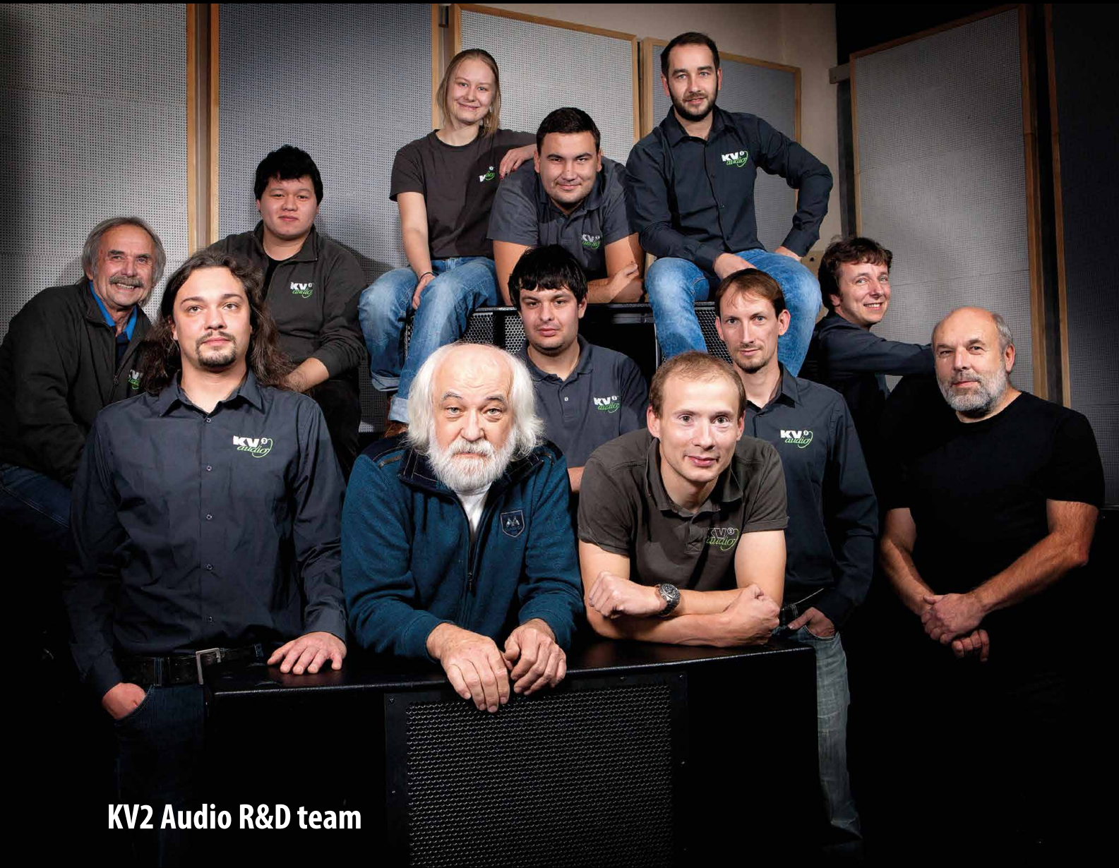
KV2 Audio R&D team

KV2 Audio's JK Series of DI Boxes and Audio Tools provide the ultimate solution in transferring unbalanced signals to balanced signals. They deliver crystal clear, distortion-free audio from any source over greater distances. KV2 has optimized the use of phantom power in the JK series with a switching power supply, providing a huge 20-volts of peak power on the internal rails. This allows the JK Series to deliver 50 Ohms on the XLR output giving true line driver capability. With line drivers delivering a high quality balanced signal on a low impedance output this gives the JK Series the ability to deliver greater audio integrity and output over any cable length and up to four times further than it's nearest competitor. It also means far greater headroom - nearly double that of any other phantom powered unit.